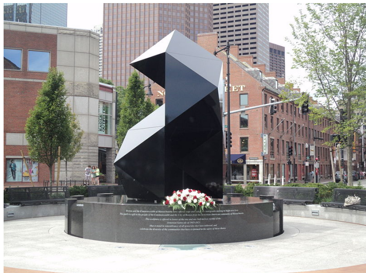
The Sculpture in 2012

The Greenway is in the midst of an ambitious five-year plan to expand its public art portfolio. For now, there's a moratorium on permanent works. But "Abstract Sculpture" - that is its official name - proves that permanence is not stasis. Some public art, striking as it is, eventually fades into the landscape. Some integrates itself into the city's daily life.