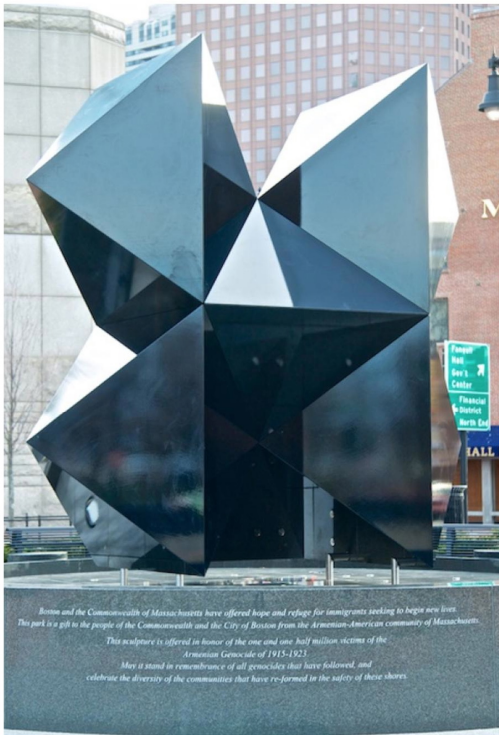
The Sculpture in 2013 MATT CONTI

summer, is irresistible. Tellalian likes to watch as families cross from Faneuil Hall toward the North End: Inevitably, children spy the labyrinth and peel off to walk its path.